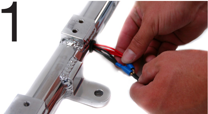
connect wires x4