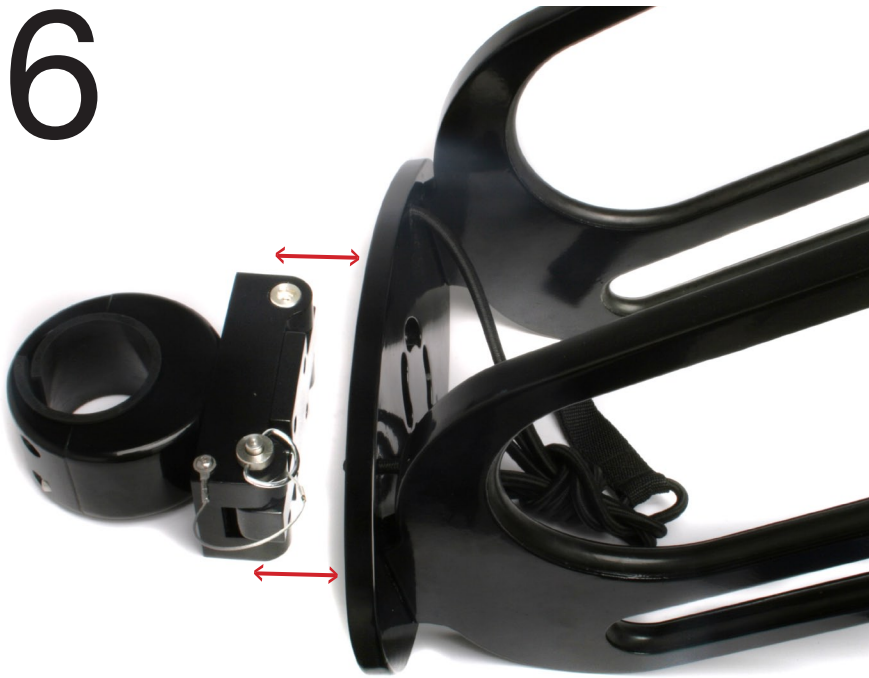
connect using bolts (x4)