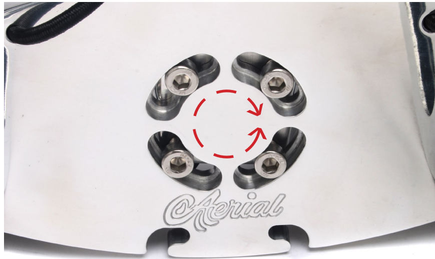
bolts can be adjusted to desired position